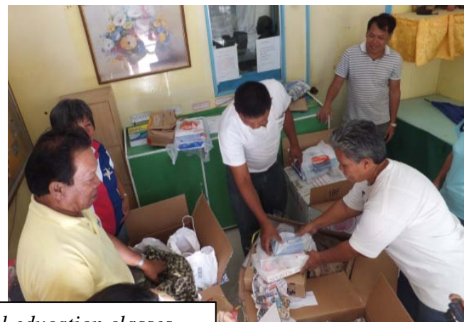
Hands-on experience in vocational education classes helps prepare students in the Philippines for success