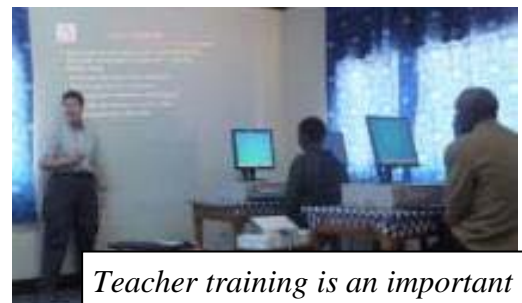
Teacher training is an important aspect of Reneal IEO's mission