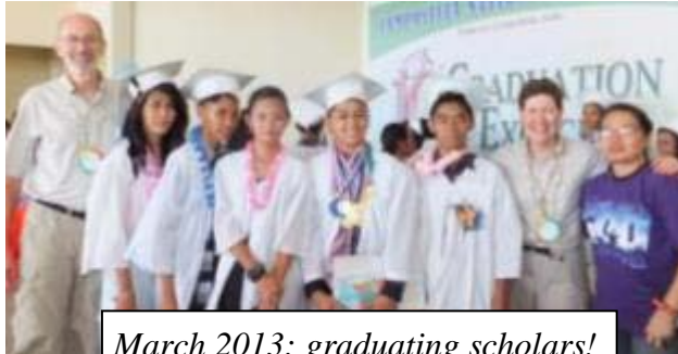
March 2013: graduating scholars!