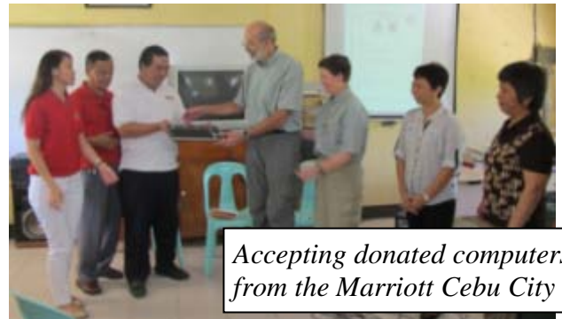
Accepting donated computers from the Marriott Cebu City