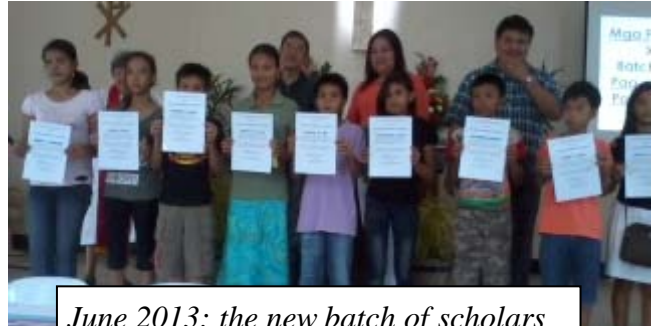
June 2013: the new batch of scholars