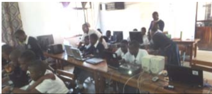
New IT lab in use at Paroma Secondary School, Tanzania