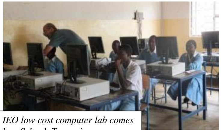
Before and After: a Reneal IEO low-cost computer lab comes to life at Mlangarini Secondary School, Tanzania