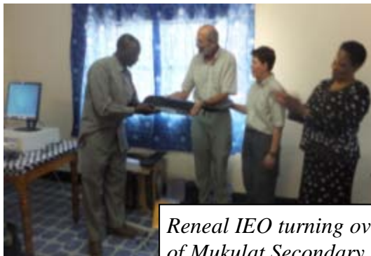
Reneal IEO turning over a new lab to the students of Mukulat Secondary School in Tanzania