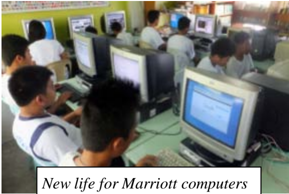
New life for Marriott computers